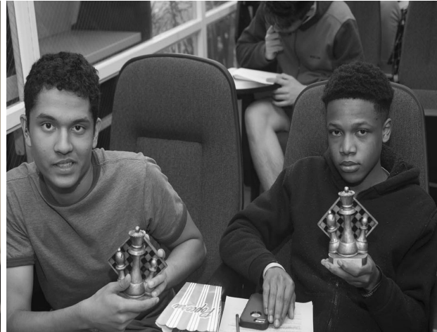
Chess Tournament Winners