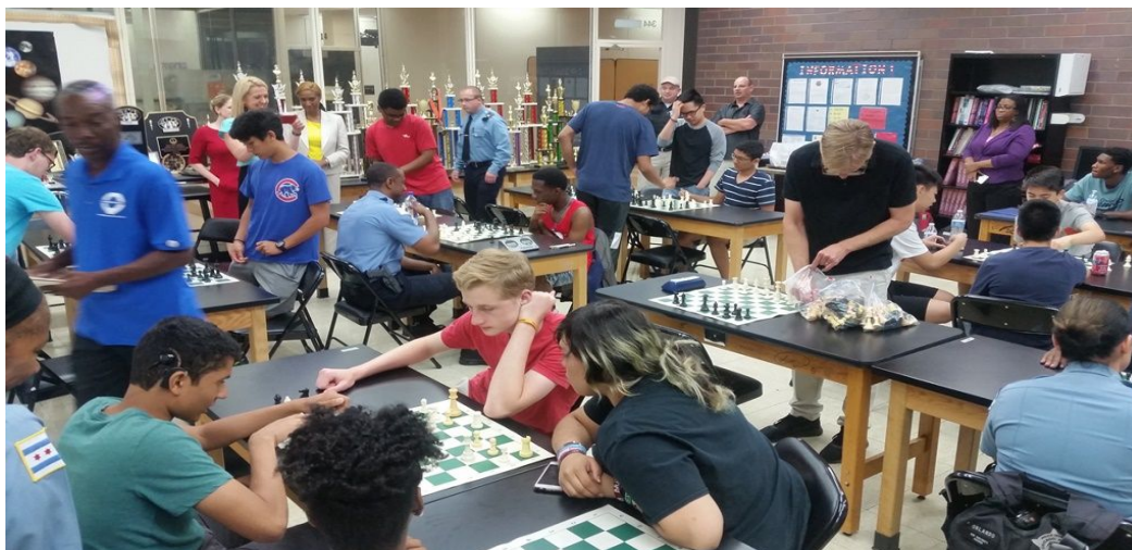
Cops & Kids Weekly Visits

While enhancing their chess skills and building new relationships, students were equipped with the tools necessary to create and promote peace in their home and school communities, build positive relationships, and enhance their leadership skills by teaching peers and police officers the game of chess. The anticipated outcomes were met as each student who participated gained a wealth of useful information that will hopefully transform their lives and community for the better, one chess move at a time.