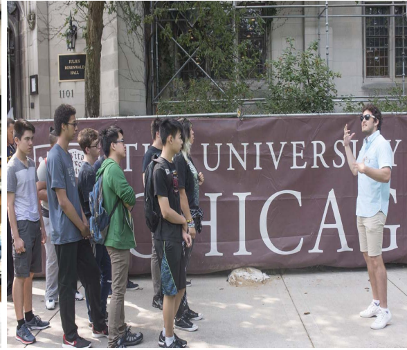
University of Chicago College Tour