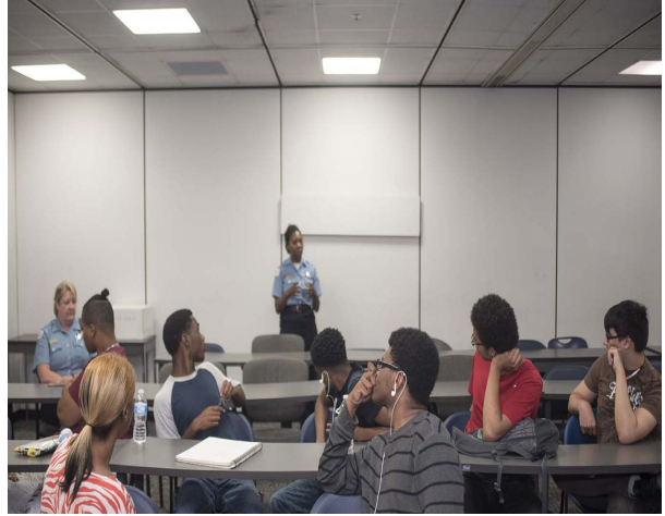
Chess Games at Navy Pier/Police Academy Tour